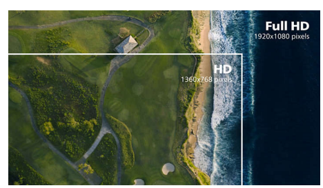
Picture quality matters. Regular displays deliver quality, but you expect more. This display

features enhanced Full HD 1920 x 1080 resolution. With Full HD for crisp detail paired with high brightness, incredible contrast and realistic colors expect a true to life picture.