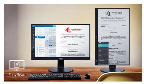
EasyRead mode for a paper-like reading experience