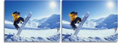
2ms GtG response time > 2ms GtG response time

SmartResponse is an exclusive Philips overdrive technology that when turned on, automatically adjusts response times to specific application requirements like gaming and movies which require faster response times in order to produce judder, time-lag and ghost image free images