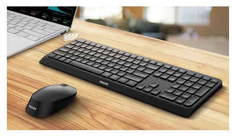
Keep the computer wires at bay. For any keyboard/mouse equipped with this feature, you can connect the accessory to any PC via a speedy 2.4 Hz wireless connection. The simple

setup process, along with the accessory's sleek design, is sure to leave your workspace looking clean and wire-free.