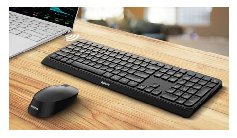
Easy to connect and tangle free, the wireless design makes life more simple.