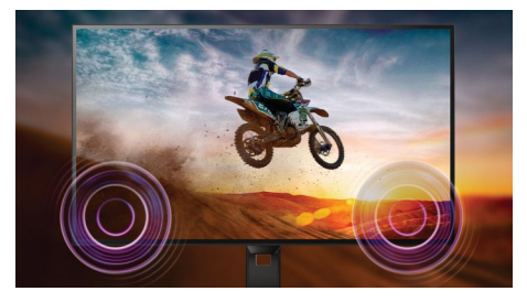
A pair of high quality stereo speakers built into a display device. It can be visible front firing, or invisible down firing, top firing, rear firing, etc depending on model and design.