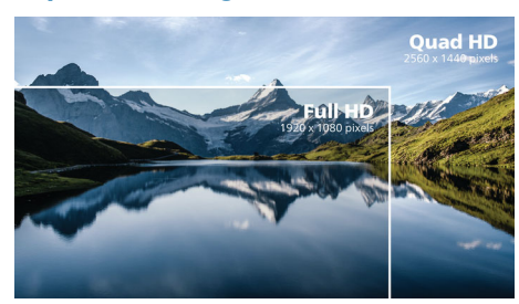
These Philips screens deliver Crystalclear, Quad HD 2560x1440 or 2560x1080 pixel

images. Utilizing high performance panels with high density pixel count, enabled by high bandwidth sources like USB-C, Displayport, HDMI, these new displays will make your images and graphics come alive. Whether you are demanding professional requiring extremely detailed information for CAD-CAM solutions, using 3D graphic applications or a financial wizard working on huge spreadsheets, Philips displays will give you Crystalclear images.