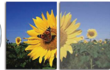
With SmartImage Without SmartImage

SmartImage is an exclusive leading edge Philips technology that analyzes the content displayed on your screen and gives you optimized display performance. This user friendly interface allows you to select various modes like Office, Image, Entertainment, Economy etc., to fit the application in use. Based on the selection, SmartImage dynamically optimizes the contrast, color saturation and sharpness of images and videos for ultimate display performance. The Economy mode option offers you major power savings. All in real time with the press of a single button!