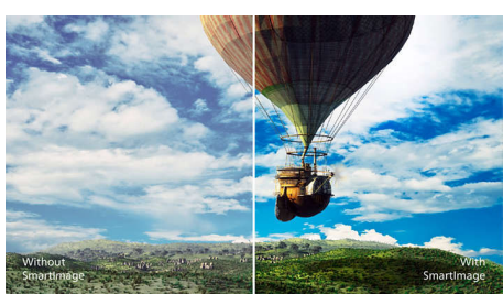
SmartImage is an exclusive leading edge Philips technology that analyzes the content displayed

on your screen and gives you optimized display performance. This user friendly interface allows you to select various modes like Office, Photo, Movie, Game, Economy etc., to fit the application in use. Based on the selection, SmartImage dynamically optimizes the contrast, color saturation and sharpness of images and videos for ultimate display performance. The Economy mode option offers you major power savings. All in real time with the press of a single button!