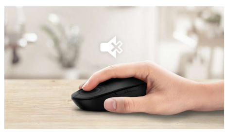
Reduced click sound, for quiet and comfortable experience