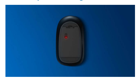
High definition optical tracking for smooth control