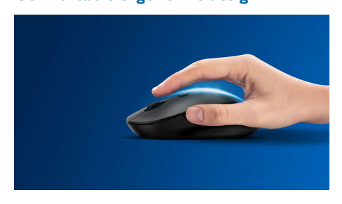
Comfortable ergonomic mouse design feels great