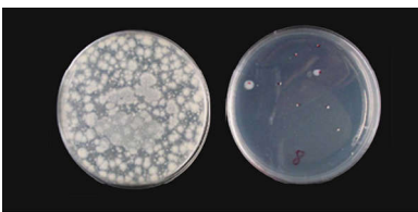
Before After 24 hours