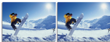
2ms GtG response time > 2ms GtG response time

SmartResponse is an exclusive Philips overdrive technology that when turned on, automatically adjusts response times to specific application requirements like gaming and movies which require faster response times in order to