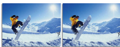
2ms GtG response time > 2ms GtG response time

SmartResponse is an exclusive Philips overdrive technology that when turned on, automatically adjusts response times to specific application requirements like gaming and movies which require faster response times in order to produce judder, time-lag and ghost image free images