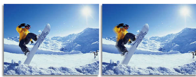
2ms GtG response time > 2ms GtG response time

Turbo modes turns on over drive circuit for best response time, reduce jaggy edges for fast moving objects on screen, enhance contrast ratio for bright and dark scheme, this profile delivers the best gaming and movie experience.