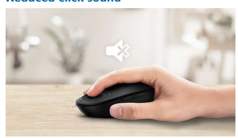
Reduced click sound, for a quiet and comfortable experience