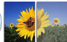
With SmartImage Without SmartImage

SmartImage is an exclusive leading edge Philips technology that analyzes the content displayed on your screen and gives you optimized display performance. This user friendly interface allows you to select various modes like Office, Image, Entertainment, Economy etc., to fit the application in use. Based on the selection, SmartImage dynamically optimizes the contrast, color saturation and sharpness of images and videos for ultimate display performance. The Economy mode option offers you major power savings. All in real time with the press of a single button!