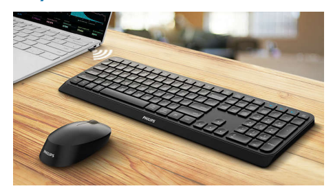
Easy to connect and tangle free, the wireless design makes life more simple.