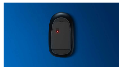
High-definition optical tracking for smooth control