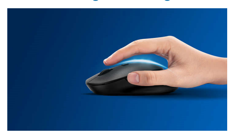
Comfortable ergonomic mouse design feels great