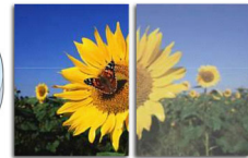
With SmartImage Without SmartImage

SmartImage is an exclusive leading edge Philips technology that analyzes the content displayed on your screen and gives you optimized display performance. This user friendly interface allows you to select various modes like Office, Image, Entertainment, Economy etc., to fit the application in use. Based on the selection, SmartImage dynamically optimizes the contrast, color saturation and sharpness of images and videos for ultimate display performance. The Economy mode option offers you major power savings. All in real time with the press of a single button!