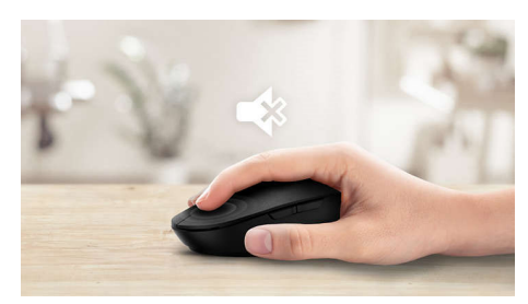
Reduced click sound, for a quiet and comfortable experience