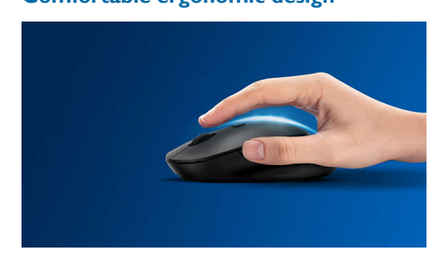
Comfortable ergonomic mouse design feels great