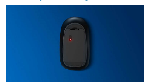
High-definition optical tracking for smooth control