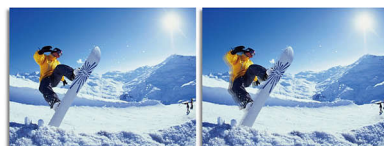
2ms GtG response time