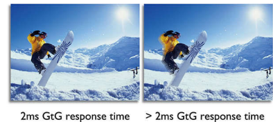
2ms GtG response time > 2ms GtG response time

SmartResponse is an exclusive Philips overdrive technology that when turned on, automatically adjusts response times to specific application requirements like gaming and movies which require faster response times in order to produce judder, time-lag and ghost image free images.