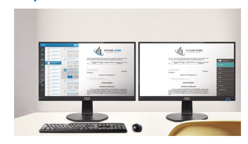
EasyRead mode for a paper-like reading experience