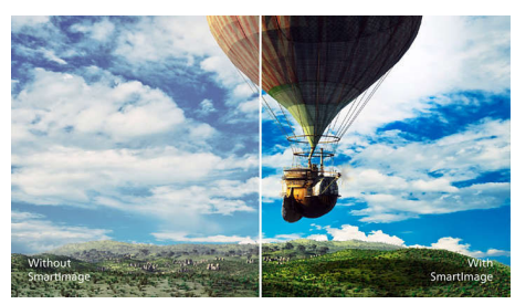
SmartImage is an exclusive leading edge Philips technology that analyzes the content displayed

on your screen and gives you optimized display performance. This user friendly interface allows you to select various modes like Office, Photo, Movie, Game, Economy etc., to fit the application in use. Based on the selection, SmartImage dynamically optimizes the contrast, color saturation and sharpness of images and videos for ultimate display performance. The Economy mode option offers you major power savings. All in real time with the press of a single button!