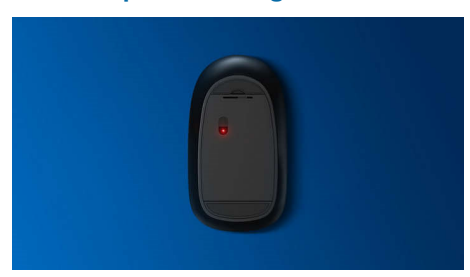
High definition optical tracking for smooth control