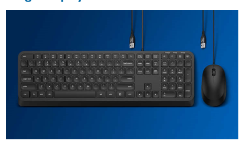
Simple plug-and-play wired USB connections