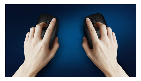
Ambidextrous shape feels good in right or left hand