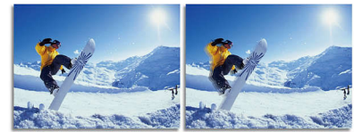
2ms GtG response time > 2ms GtG response time

SmartResponse is a exclusive Philips overdrive technology that when turned on, automatically adjusts response times to specific application requirements like gaming and movies which require faster response times in order to produce judder, time-lag and ghost image free images