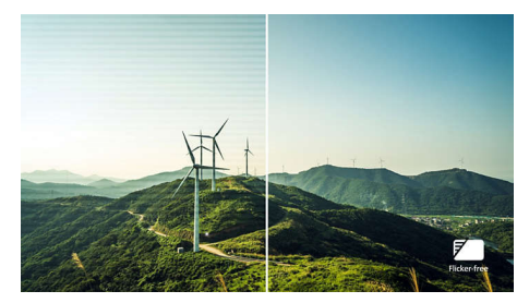
Due to the way brightness is controlled on LED-backlit screens, some users experience flicker on their screen which causes eye

fatigue. Philips Flicker-free Technology applies a new solution to regulate brightness and reduce flicker for more comfortable viewing.