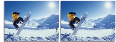
2ms GtG response time > 2ms GtG response time

SmartResponse is a exclusive Philips overdrive technology that when turned on, automatically adjusts response times to specific application requirements like gaming and movies which require faster response times in order to produce judder, time-lag and ghost image free images