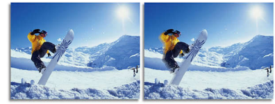
2ms GtG response time > 2ms GtG response time

SmartResponse is an exclusive Philips overdrive technology that when turned on, automatically adjusts response times to specific application requirements like gaming and movies which require faster response times in order to produce judder, time-lag and ghost image free images