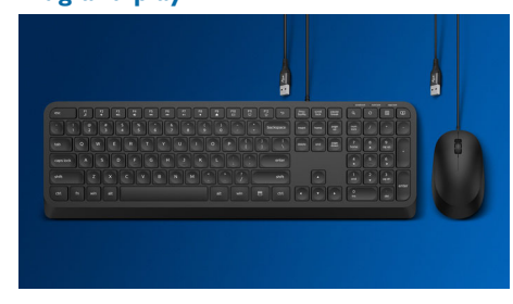
Simple plug-and-play wired USB connections