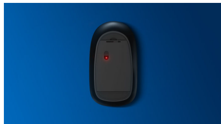
High definition optical tracking for smooth control