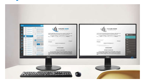
EasyRead mode for a paper-like reading experience