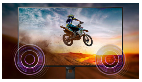
A pair of stereo speakers built into a display device. It can be visible front firing, or invisible down firing, top firing, rear firing etc, depending on model and design.