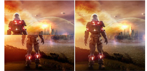
AMD FreeSync™ OFF (simulation)