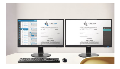
EasyRead mode for a paper-like reading experience