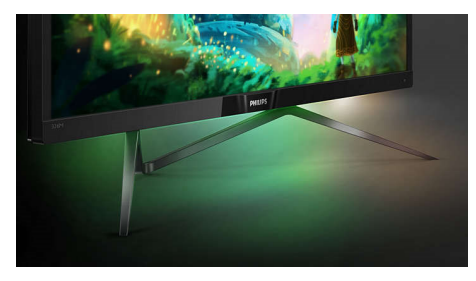
Ambiglow adds a new dimension to your viewing experience. The innovative Ambiglow

technology enlarges the screen by creating an immersive halo of light. Its fast processor analyses the incoming image content and continuously adapts the color and brightness of the emitted light to match the image. User friendly options allow you to adjust the ambiance to your liking. Especially suited for watching movies, sports or playing games, Philips Ambiglow offers you a unique and immersive viewing experience.