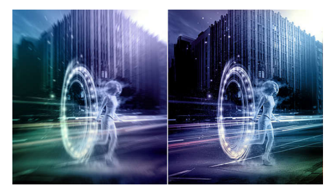
MPRT (motion picture response time) is more intuitive way to describe the response time,

which directly refers the duration from seeing blurry noise to clean and crisp images. Philips gaming monitor with 1 ms MPRT effectively eliminates smearing and motion blur, delivers shaper and precise visuals to enhance gaming experience. Best choice for playing thrilling and twitch-sensitive games.