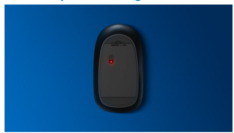
High definition optical tracking for smooth control