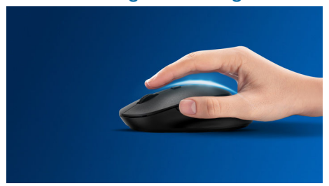
Comfortable ergonomic mouse design feels great