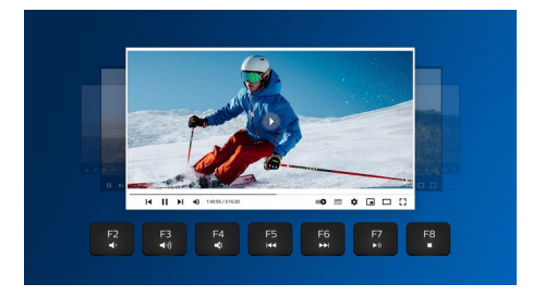
With these multi-media shortcuts, you can easily switch to music, volume, or video play by a simple click.