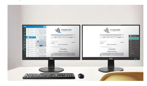
EasyRead mode for a paper-like reading experience