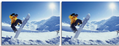
2ms GtG response time > 2ms GtG response time

Turbo modes turns on over drive circuit for best response time, reduce jaggy edges for fast moving objects on screen, enhance contrast ratio for bright and dark scheme, this profile delivers the best gaming and movie experience.