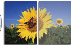
With SmartImage Without SmartImage

SmartImage is an exclusive leading edge Philips technology that analyzes the content displayed on your screen and gives you optimized display performance. This user friendly interface allows you to select various modes like Office, Image, Entertainment, Economy etc., to fit the application in use. Based on the selection, SmartImage dynamically optimizes the contrast, color saturation and sharpness of images and videos for ultimate display performance. The Economy mode option offers you major power savings. All in real time with the press of a single button!