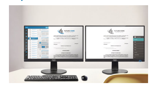
EasyRead mode for a paper-like reading experience