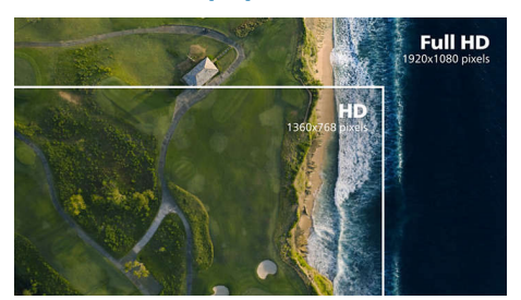
Picture quality matters. Regular displays deliver quality, but you expect more. This display