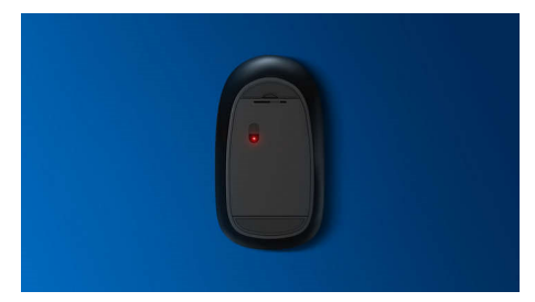
High definition optical tracking for smooth control