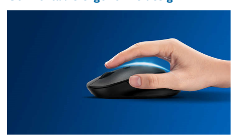
Comfortable ergonomic mouse design feels great