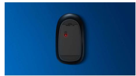
High-definition optical tracking for smooth control