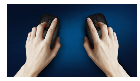
Ambidextrous shape feels good in right or left