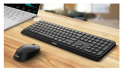
Keep the computer wires at bay. For any keyboard/mouse equipped with this feature, you can connect the accessory to any PC via a speedy 2.4 Hz wireless connection. The simple

setup process, along with the accessory's sleek design, is sure to leave your workspace looking clean and wire-free.