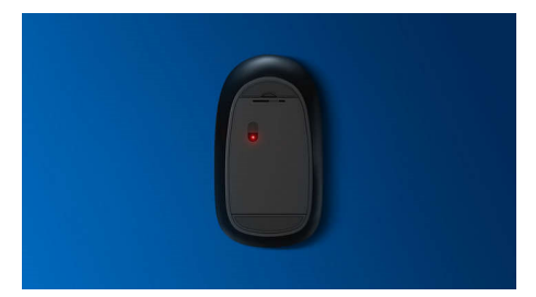
High-definition optical tracking for smooth control