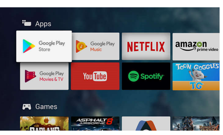
Go beyond traditional TV programming with Google Play Store and Philips App Gallery.

Experience endless movies, TV, music, apps and games online. More to love.