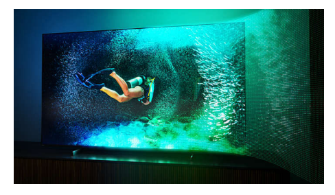
Your Philips Mini LED TV supports all major HDR formats and gives you a truly impressive big-screen picture with deep blacks and lifelike colours. Over a thousand intelligent backlight zones are independently dimmed or brightened to enable pin-sharp contrast and real depth.