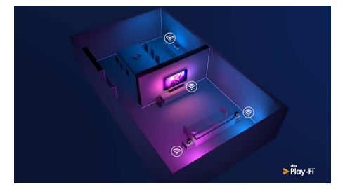
With DTS Play-Fi on your Philips TV you can connect to compatible speakers in any room. Got wireless speakers in the kitchen? Listen to the film while you make a snack or keep up with the sports commentary while you get everyone drinks.