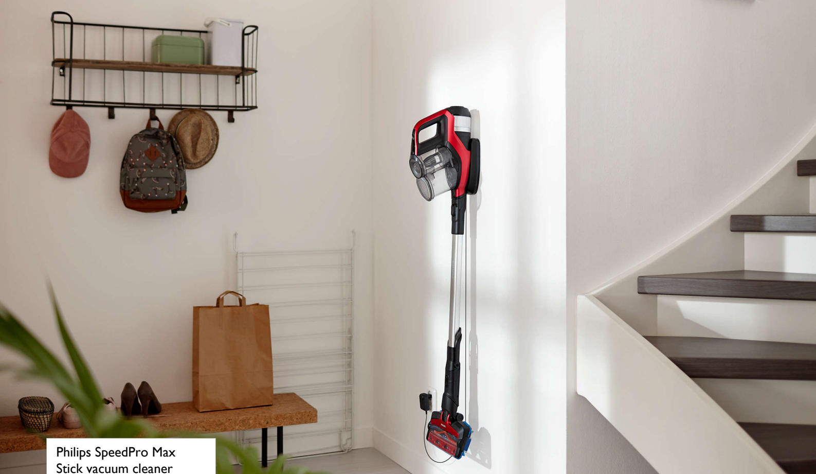
Philips SpeedPro Max Stick vacuum cleaner