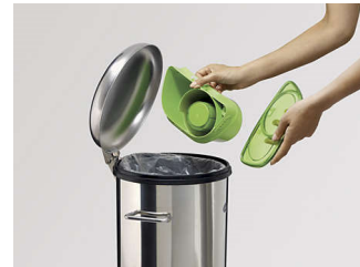
Cyclonic dustbin 1 liter