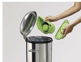
Cyclonic dustbin 1 liter