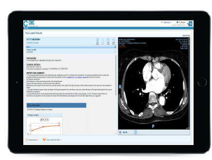
Imaging records, including final diagnostic reports, are managed from a Web-enabled dovice