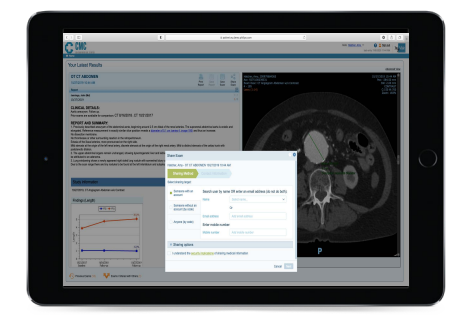
Patients choose and authorize those with whom they wish to share their images.