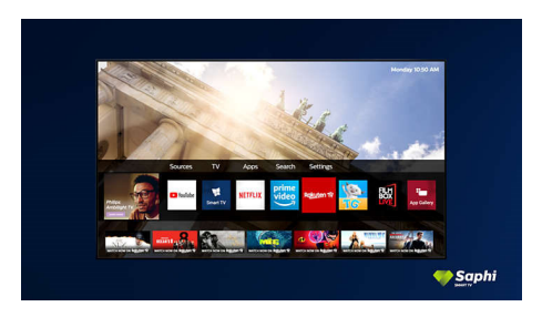
Philips TV Collection. Netflix, Prime Video, and more.