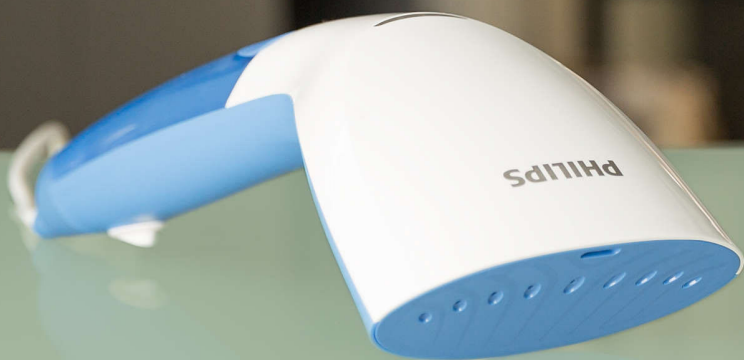
Philips Handheld garment steamer

1000W, up to 20 g/min Vertical Steaming 60ml non detachable water tank